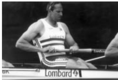
Figure 3 Steven Redgrave.

Insulin regimens for most patients range between 0.5 and 1.0 U/kg/day. This dose may be reduced in lean subjects, athletes, and during the honeymoon period, which can be prolonged in diabetic athletes. In these groups insulin doses are between 0.2 and 0.6 U/kg/day. Traditionally, regimens sought to provide a basal insulin presence by injection of intermediate or long acting insulin once or twice a day,